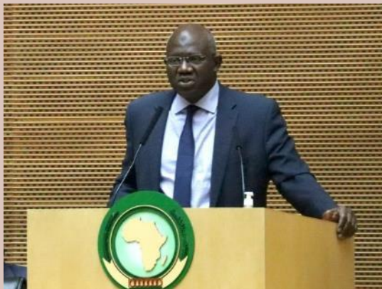
We can only achieve the target of vaccinating 70% of Africa's population by the end of 2022, by working together with all partners, governments, and other bodies. This is the only sure way to ensure health security, and recovery of the continent's economy."