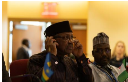
H.E. Dr. Osagie Emmanuel Ehanire, Minister of Health, Nigeria