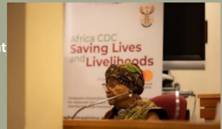
H.E. Mme. Ellen Sirleaf, Former President of Liberia, Africa Frontline First

Four key areas of Health Workforce Development were highlighted, including i) translating efforts into both health and economic gains for Africa; ii) exhilarating investment in female workers; iii) need for private sector collaboration; and iv) critical monitoring and evaluating of all public health workforce programs and initiatives on the continent. Watch the session here