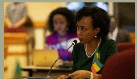
H.E. Dr. Lia Tadesse, Minister of Health, Ethiopia