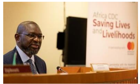
Ahmed Ogwel Ouma, Acting Director, Africa CDC

The session called for the full implementation of Africa's New Public Health Order, which includes strengthening African institutions for public health; strengthening the public health workforce; expanding local manufacturing of health products; increasing domestic investment in health; and promoting action-oriented and respectful partnerships. Watch the call to action here