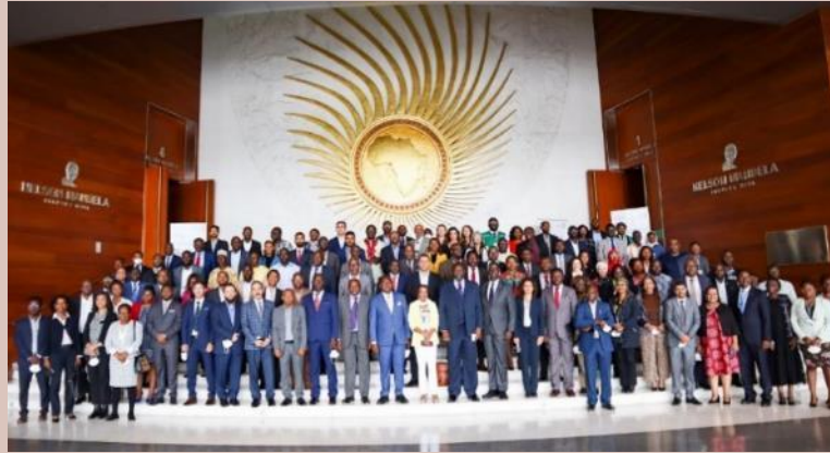
Delegates pose for a group photo at the Continental EPI Managers' Workshop for the Acceleration of COVID-19

Continental workshop for managers in the Expanded Programme on Immunization (EPI). The Africa CDC, in collaboration with UNICEF, the WHO, and other stakeholders hosted a workshop to track progress towards the 70% vaccination target by the end of 2022, while reaching most vulnerable groups and strengthening countries' health systems and routine immunization. Over 200 delegates from African Union member states and partners attended the workshop held on September 5 in Addis Ababa, Ethiopia, including an official delegation of 46 member states. Read more