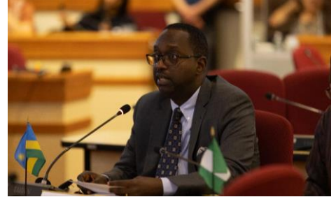
H.E. Dr. Daniel Ngamije, Minister of Health, Rwanda