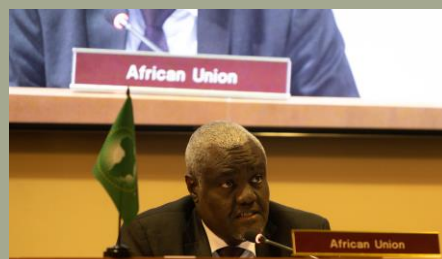
H.E. Mr. Moussa Faki Mahamat, Chairperson, African Union Commission