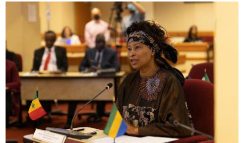
H.E. Ms. Aissata Tall Sall, Minister of Foreign Affairs and Senegalese Abroad, Senegal