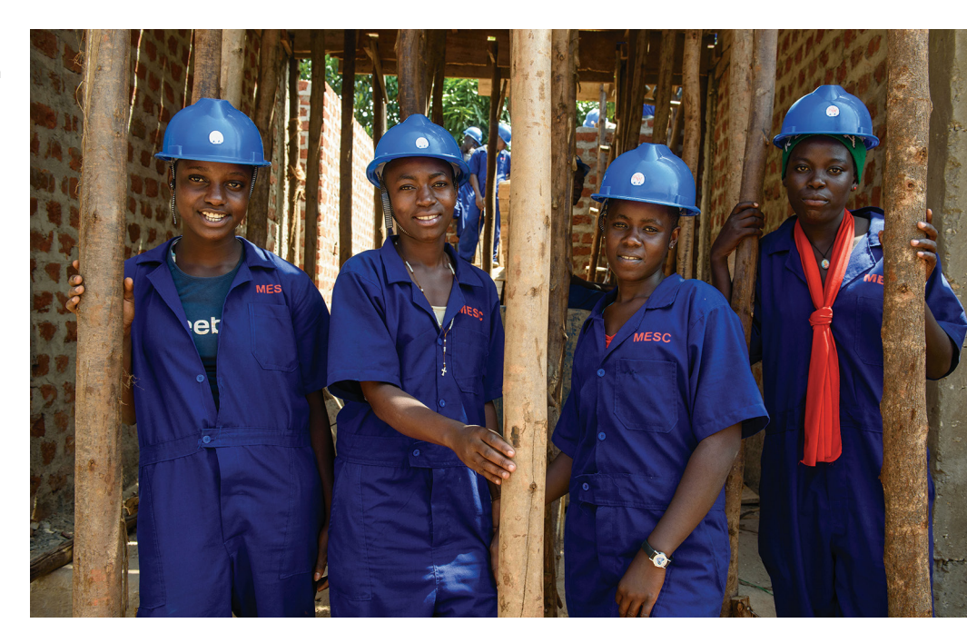
Programs like U-LEARN Phase II in Uganda encourage young women to train in sectors typically dominated by men, such as construction. INTERSECT FOR MASTERCARD FOUNDATION

One consequence of these gendered barriers, operating in combination with gender differences in educational outcomes and the overall shortage of economic opportunities, is the concentration of young women in enterprises and sectors with lower levels of profitability and growth potential. Over half of young women in nine Sub-Saharan African countries operate businesses in which no employment is created: 72 percent of female-owned businesses and 58 percent of male-owned businesses are in the overcrowded retail sector, known to have limited potential for growth,<sup>89</sup> although it is notably more secure than rain-fed agriculture.