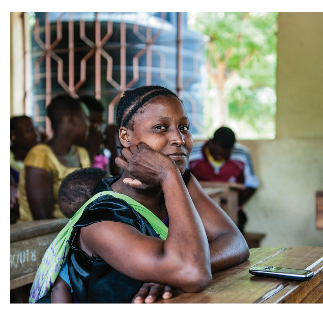
Inside a meeting of the Tupendane Mavuno savings group. The group, which was part of the U-LEARN program, now has more than 40 members.

quantify or attempt to triangulate the added value of gender-focused or gender-responsive features such as child care, gender-based recruitment targets, or efforts to change gender norms and stereotypes concerning work and livelihoods. As such, although it is possible to present some insights into whether these features "worked," this cannot be considered "robust evidence" or be used to draw firm conclusions as to how transformative these specific features were.