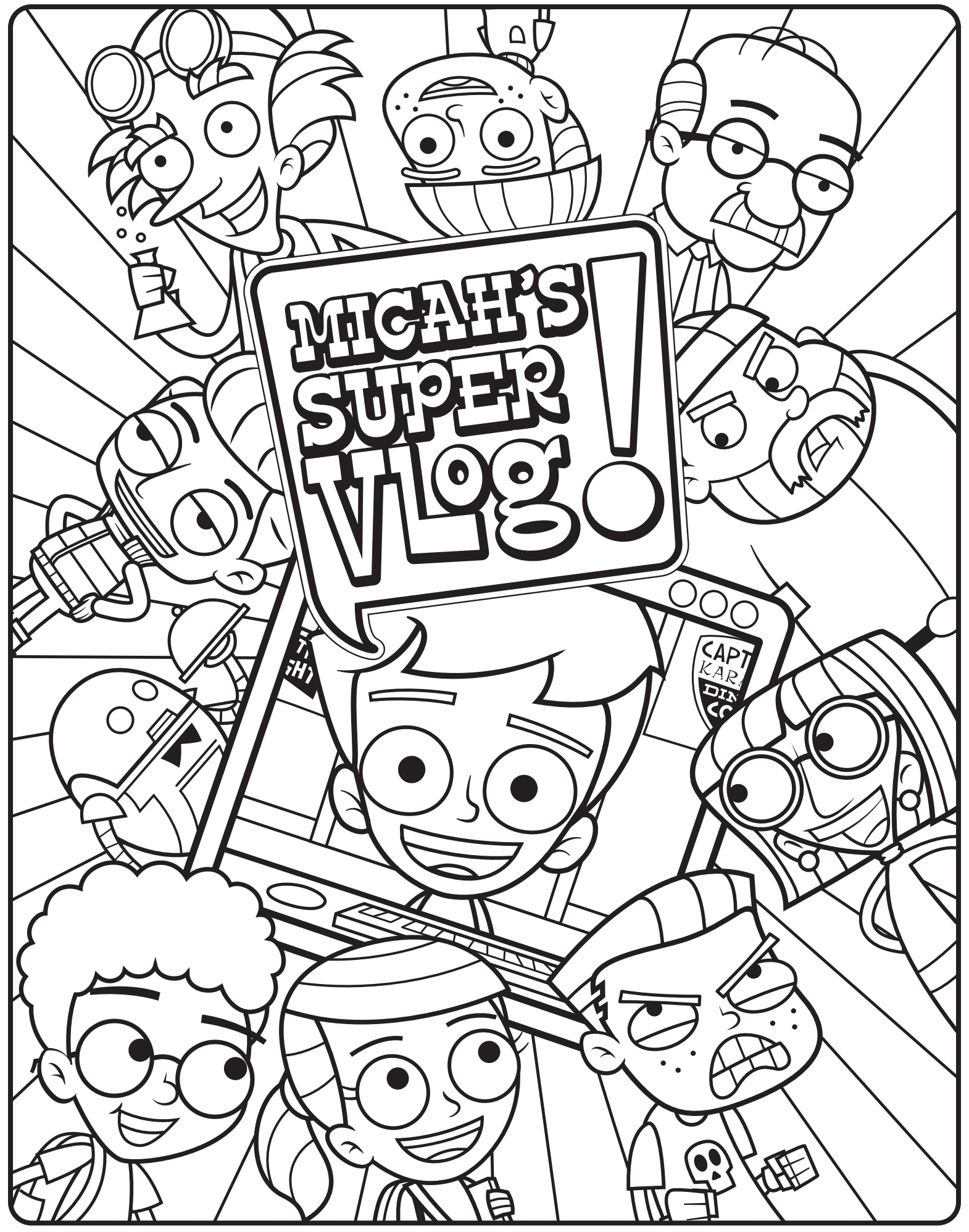
© 2019 Winsome Truth, Inc. Micah's Super Vlog characters and artwork appear courtesy of Square One World Media and are used per licensing agreement. All rights reserved.