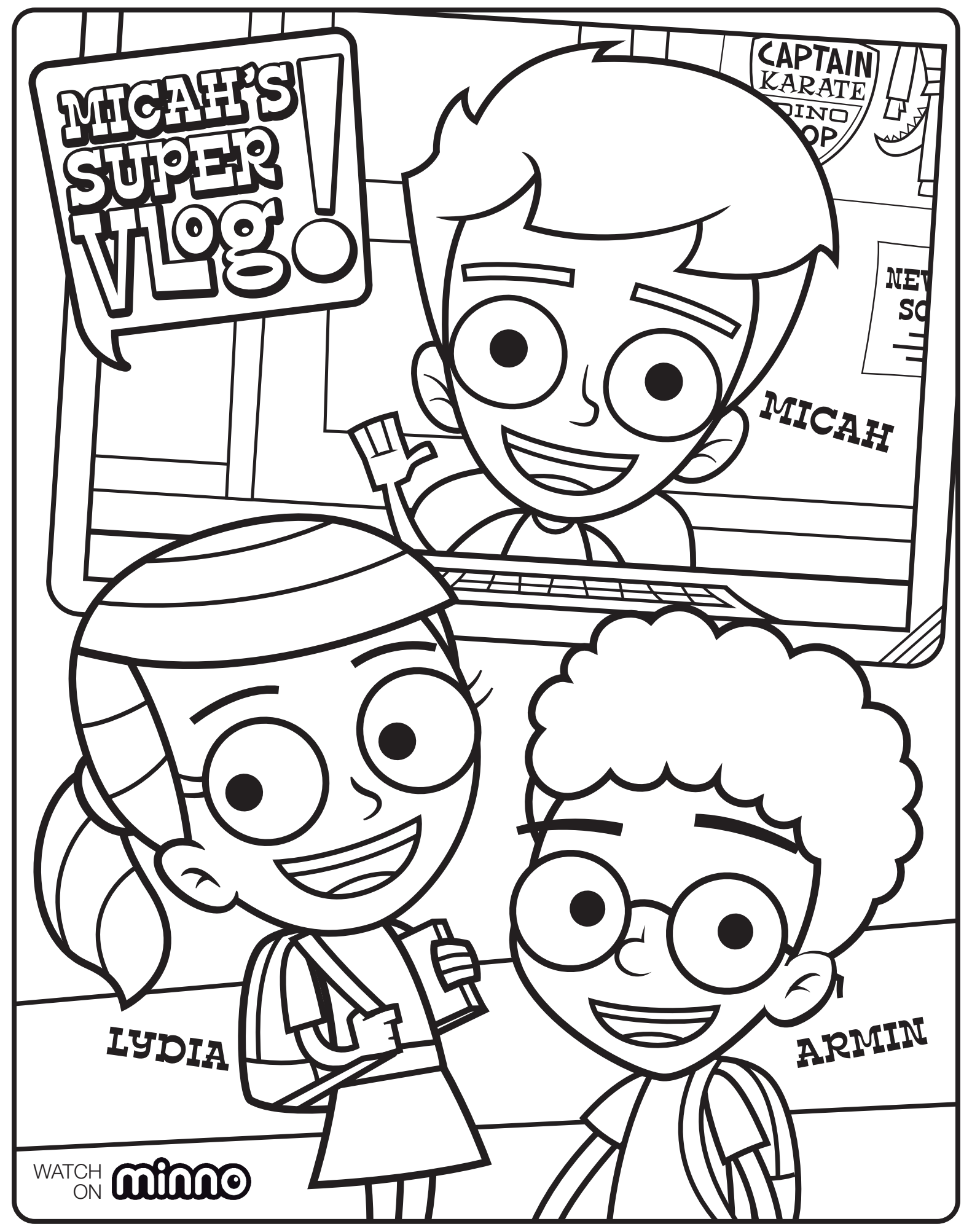
© 2019 Winsome Truth, Inc. Micah's Super Vlog characters and artwork appear courtesy of Square One World Media and are used per licensing agreement. All rights reserved.