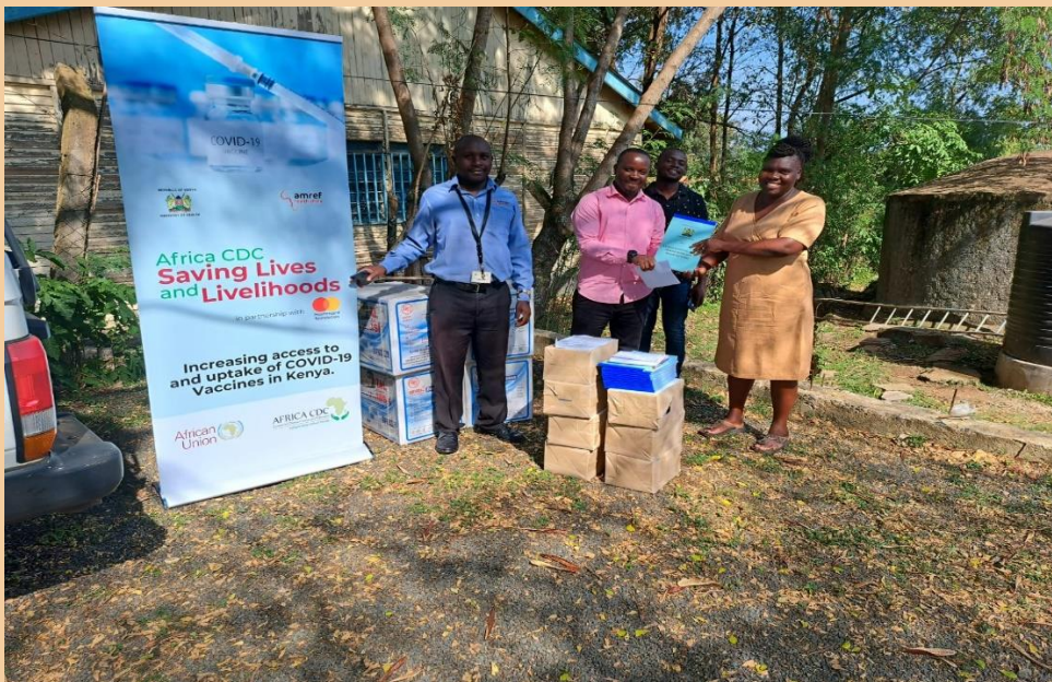
Distribution of AEFI forms and PPEs to EPI Logistician at Homabay county.

Enhanced pharmacovigilance and causality assessment tracking: The program has produced and distributed a total of 5,000 Adverse Events Following Immunization (AEFI) data collection tools to strengthen the MoH Pharmacovigilance network's timely reporting, response, and management of AEFI cases across the country.