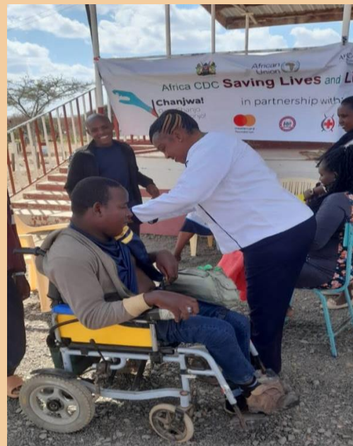
Targeted community vaccine mobilization of people living with disabilities, women, and youth groups by SLL CHVs.

Improved demand creation and community engagement: The program has engaged, trained, and deployed a total of 1,200 community health volunteers to support MoH's efforts in conducting RCCE activities ranging from community mobilization, door-to-door mobilization, motorized campaigns, targeted sensitization, engagement of community governance structures, defaulter tracking, etc. within the communities, which has resulted in an uptake of COVID-19 vaccines.