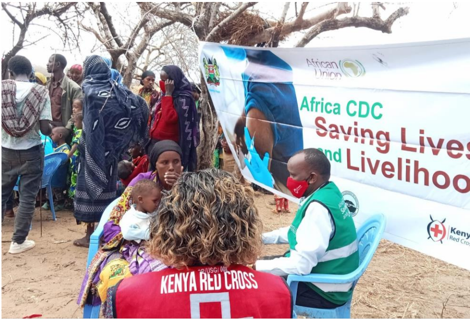
Mobilization and vaccination ongoing in Marsabit County with SLL CVCs.

Improved human capacity building and job creation: The program has also supported MoH in recruiting personnel to support data entry at the Kenya Pharmacovigilance and Poisons Board while conducting a series of training and mentorship sessions to build the capacity of health workers to improve their job performance at the CVCs.