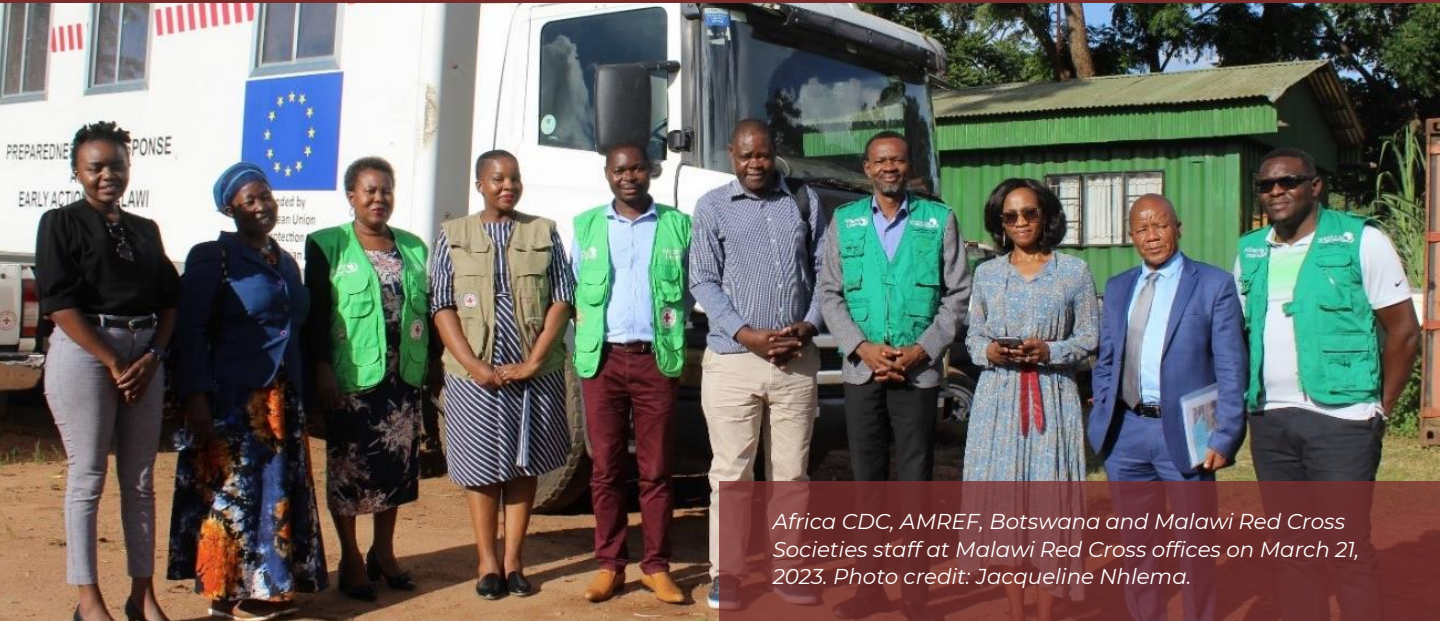
Africa CDC, AMREF, Botswana and Malawi Red Cross Societies staff at Malawi Red Cross offices on March 21, 2023.

Snapshot of key successes for COVID-19 vaccination acceleration in Africa.