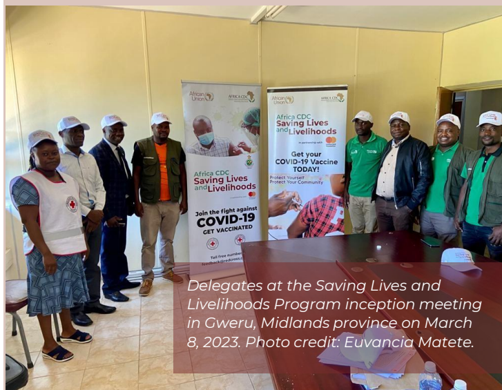
Delegates at the Saving Lives and Livelihoods Program inception meeting in Gweru, Midlands province on March 8, 2023.

Key approaches include understanding community beliefs, fears, rumours, questions, and suggestions about COVID-19 and vaccines to inform the response, as well as reducing fear, stigma, and misinformation about vaccines.