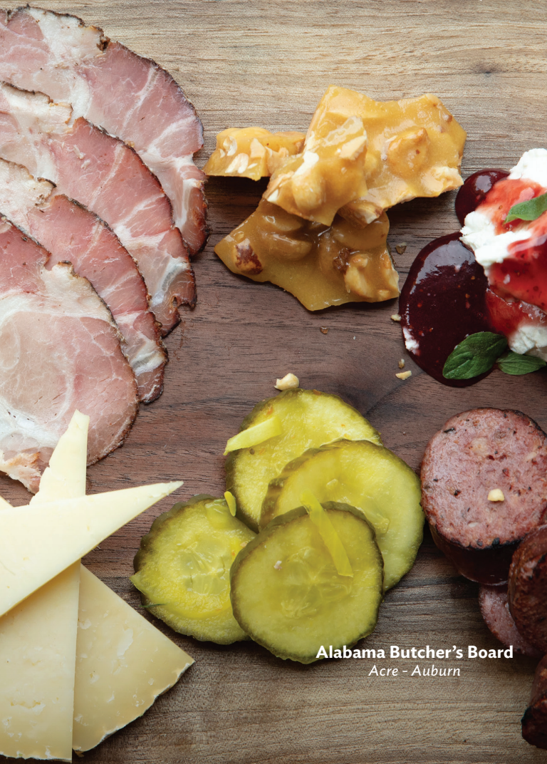
Alabama Butcher's Board Acre - Auburn