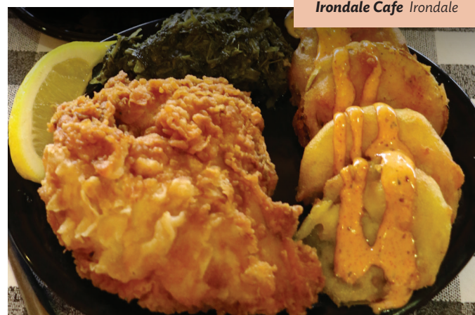
Irondale Cafe Irondale