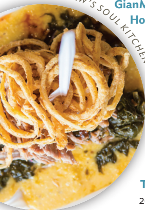
SAW'S SOUL KITCHEN

Larkin Restaurant & Deli Soul food 205-392-9988