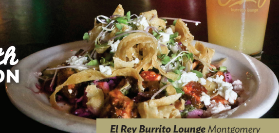
El Rey Burrito Lounge Montgomery