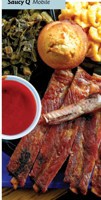
Saucy Q Mobile

◆ The Grand Hall at the Grand Hotel Marriott Resort (1847) Signature Lump Crab Scramble 251-928-9201