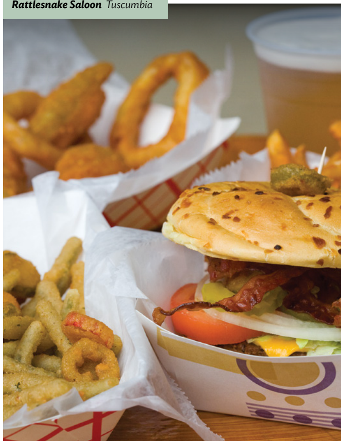
Rattlesnake Saloon Tuscumbia

The Palace Harvey's Milkshake 256-386-8210