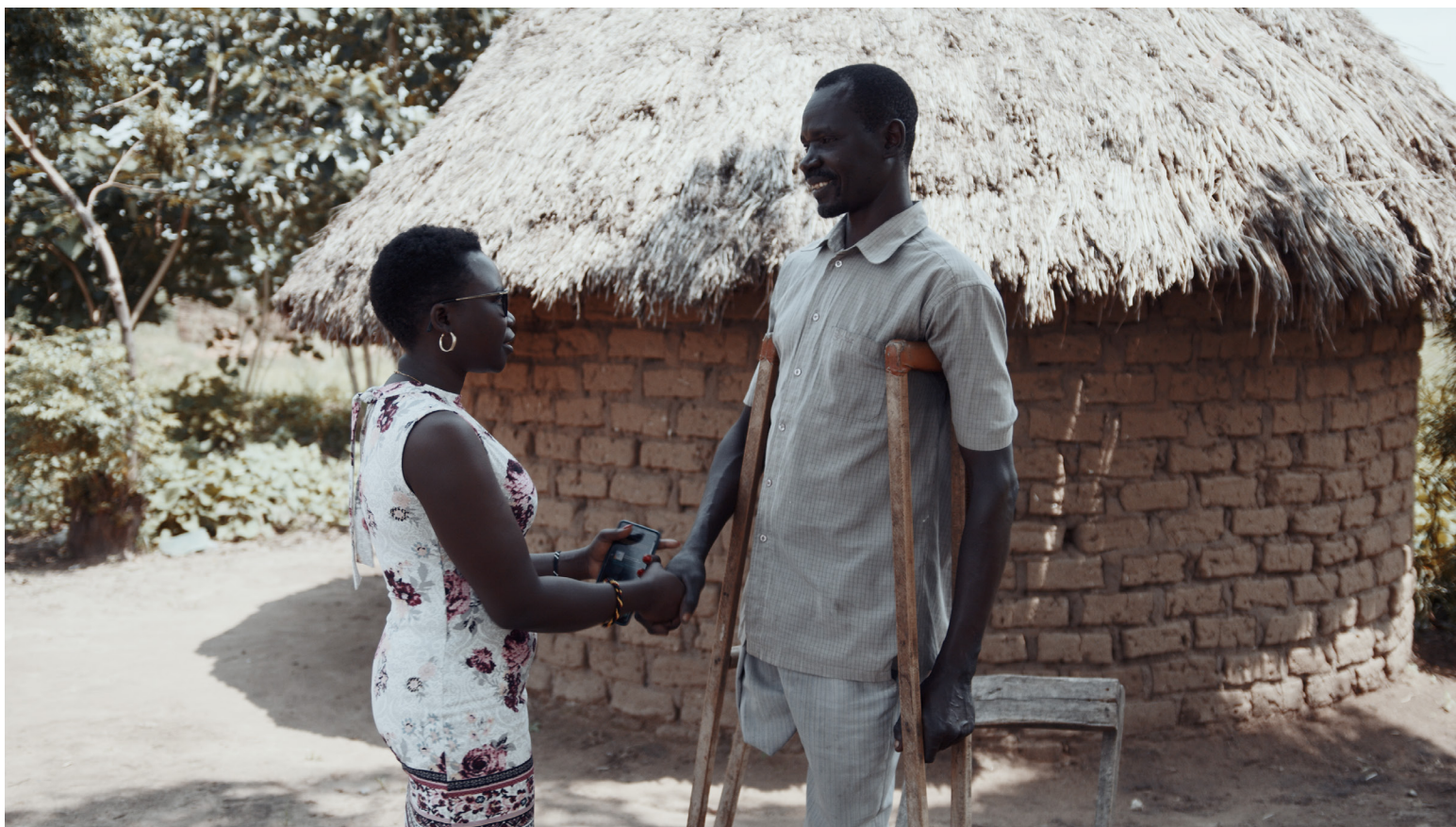
Mr. Opiyo's resilience in the face of adversity inspired me to create Craftwear City Uganda, where I could empower people with disabilities to learn valuable skills and earn a living.