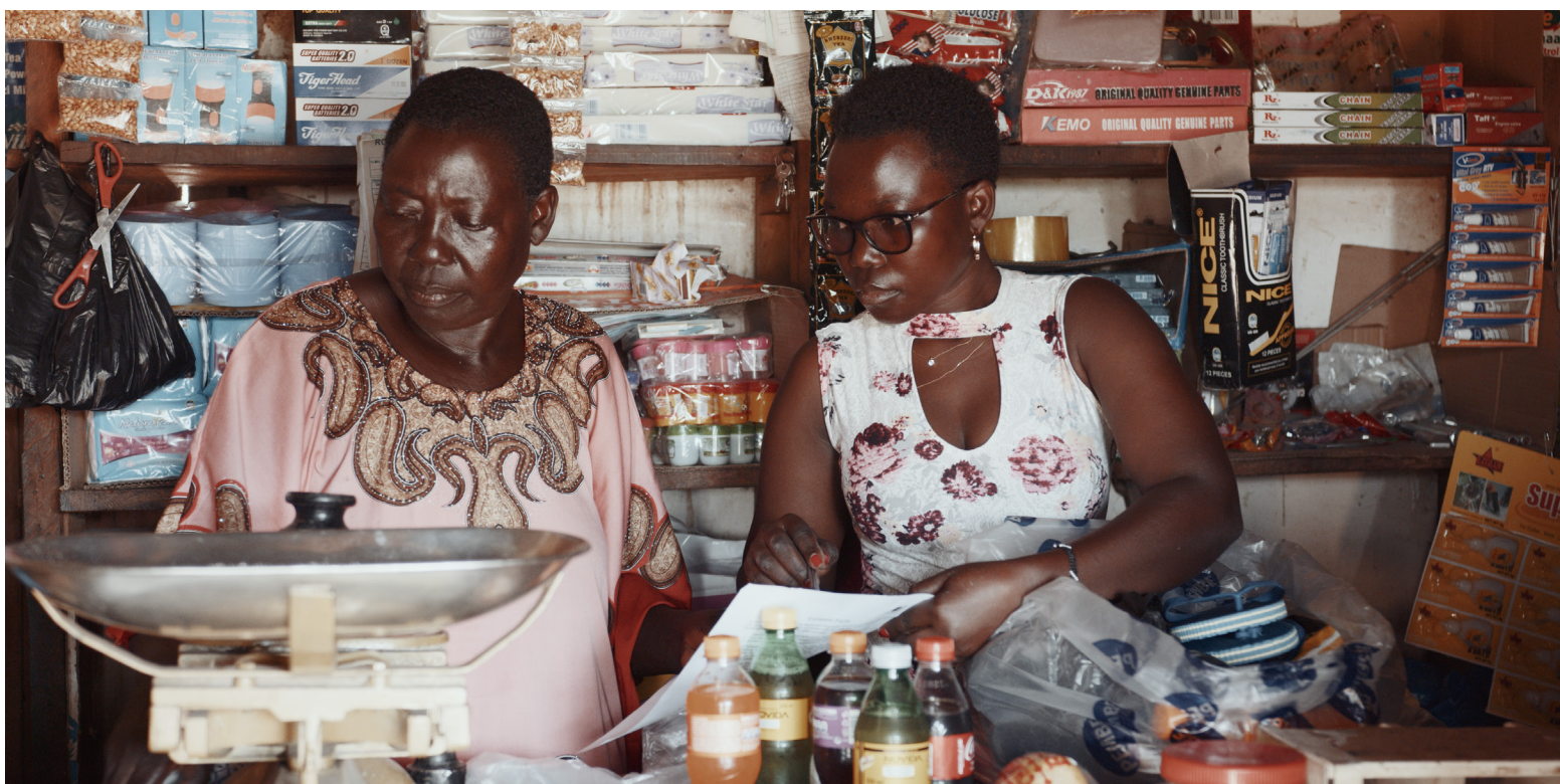
My mother has always been a hardworking entrepreneur, running her shop with dedication, and I believe it's from her that I inherited my own drive for business and success.